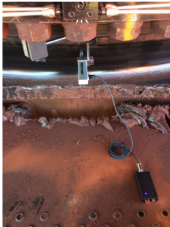
Motionics WiMER3 measurement instrumentations in use