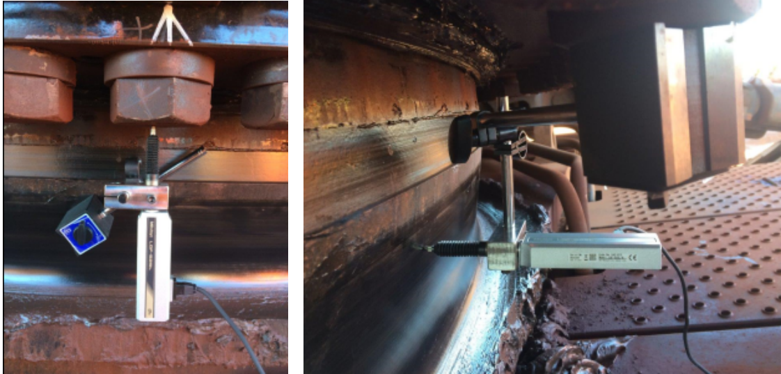
WiMER3 taking wireless measurements on site