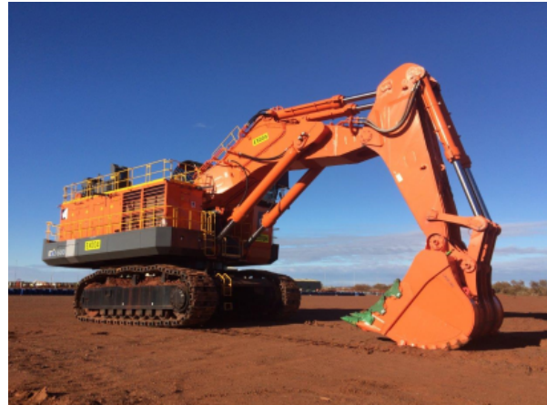
Australian mining site and the equipment under measurement