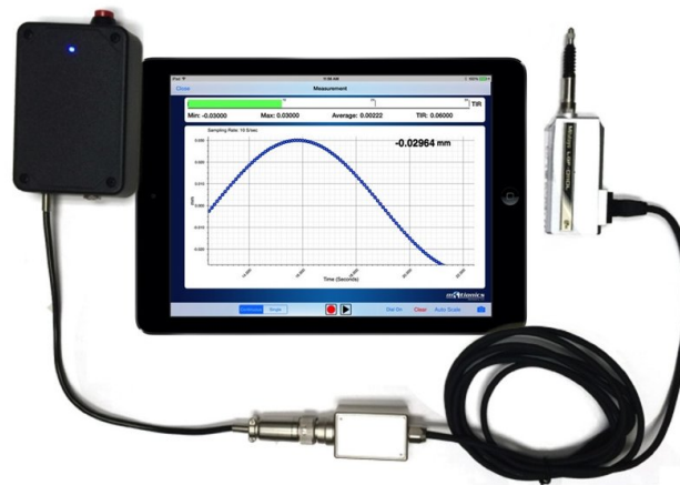
Wireless Measurement Read (WiMER3) transmitter for Linear Gages and LVDTs

company that implemented the WiMER3 for on site measurements to decrease risk of injury for workers.