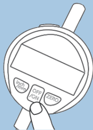
① Dial indicator